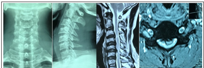
Figure 1: Preoperative X-ray and magnetic resonance imaging of the cervical spine showing disc space reduction in C5/6 and prolapse of C5/6 disc causing compression to the spinal cord with myelomalacic change.

Patient in the supine position. Tong traction applied. A sandbag was applied in the interscapular area. Transverse skin incisions over the targeted vertebral level were made. The platysma incised. The esophagus retracted medially, and