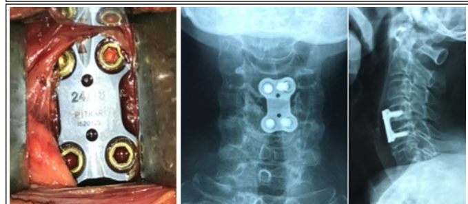
Figure 4: Intraoperative picture with postoperative X-ray showing plate fixation.