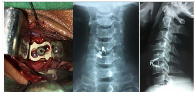
Figure 2: Intraoperative image and post-operative X-ray showing placement of standalone polyetheretherketone cage with a screw.